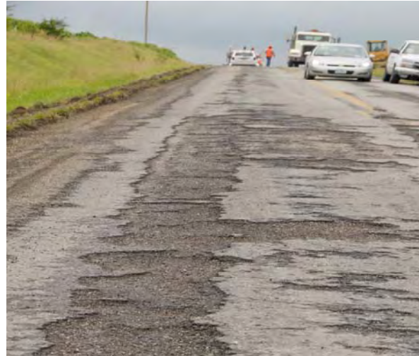
Figure 1: Pavement rutting and Cracking, Route H, Gentry County

State DOT's across the country are facing the same pressures to do more with less and deliver more value for every tax dollar spent. With continually rising oil prices and the expense of prepping the road prior to an HMA overlay, the Northwest District sought out a cheaper way of rehabilitating these pavements. The alternative they chose was a Cold In-Place Recycled (CIR) Asphalt Overlay. This overlay uses existing material and is therefore more environmentally friendly and further reduces trucking costs for disposal and to bring new material on site. Also, the cost of maintenance operations to prepare the roadway prior to the contractor is reduced or eliminated with the CIR. Northwest District Area Engineer Marty Liles, Maintenance Superintendent Charles Roach and maintenance employees from the Albany and King City area, led the test project of CIR for the Northwest District.