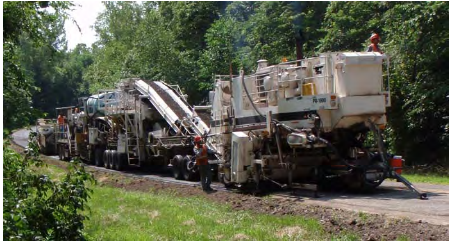
Figure 2: CIR paving train

Both routes were closed to all but local traffic during the project. However, traffic was allowed to proceed on the new overlay within two hours of roller compaction. After the CIR operations were completed, maintenance employees at the Albany and King City facilities applied a chip seal to both routes as a means of sealing the pavement surface. MoDOT also supplied traffic control throughout the CIR operations. Both of these services helped lower project costs. The cost for the 2" CIR (not including chip seal) was $29,045 per mile and the cost for the 3" CIR was $34,147.