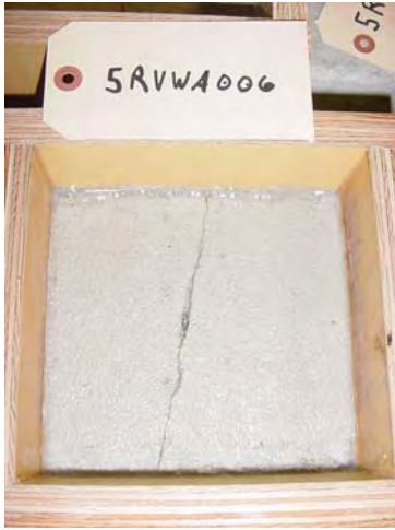
Figure 2 – Crack Sealer Test