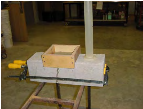
Same beam before sealed test, leaked in 3 seconds.