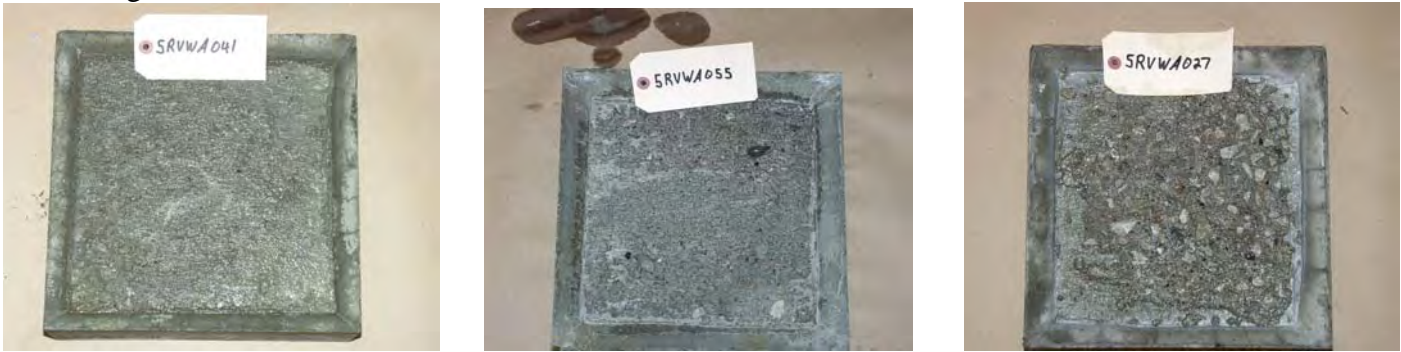
Linseed Oil 50 Cycles Rating = 0