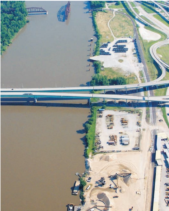
Figure 3, St Joseph’s Highway, Railway, and Waterway Transportation Networks.