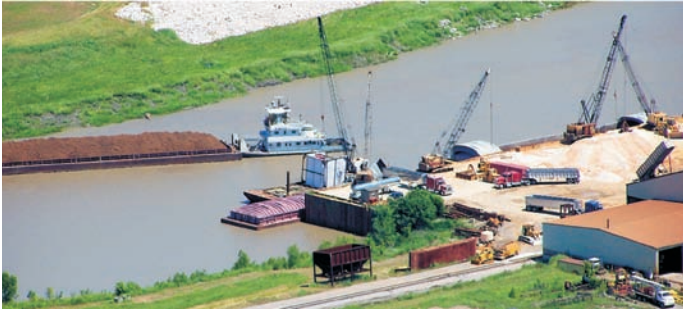
Figure 2, Barges dwarf semi-trucks at the SEMO Port Authority