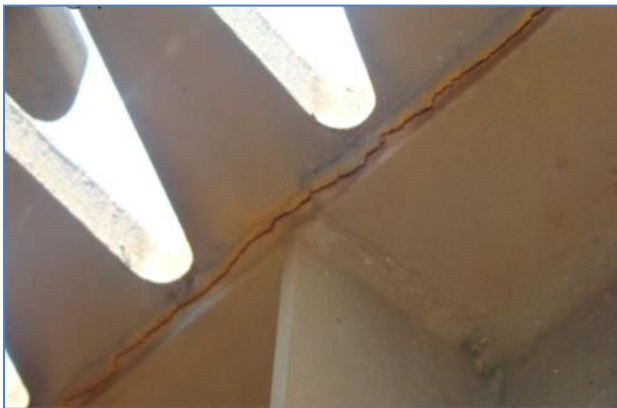
Fractured support weld on finger plate expansion device

recommended for use on less important routes with lower traffic volumes. The existing flat plate expansion device designs were modified to include adjustability of the device prior to concrete placement. Repair and retrofit best practices and details that can be implemented without concrete deck removal were developed for existing expansion devices. The new designs accommodate a wide variety of superstructure sizes, configurations, from 4 to 16 inches of movement, and from 0 to 60 degree skews when used with steel girders. New finger plate expansion devices and existing finger plate expansion device modifications were developed using infinite fatigue life criteria to exceed a design life of 40 years.