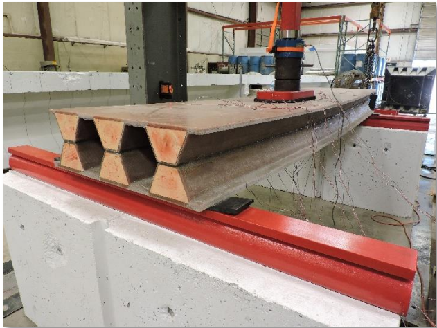
Full Scale Load Test